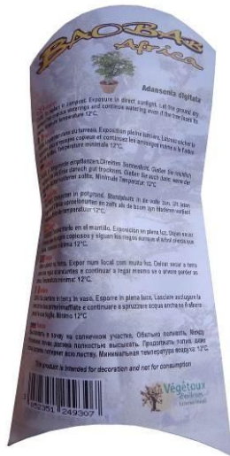
Kit Little Baobab