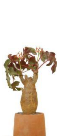
Baobab Buddha 3 years

Packaging format 24X 7 - Baobab Buddha size: 25/30 cm - Average weight: 200g/500g - Instructions for use in 8 languages