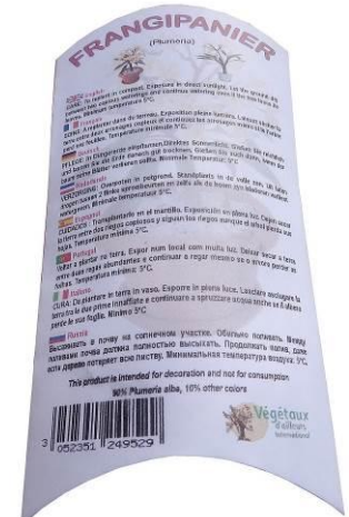
Kit Little Frangipani