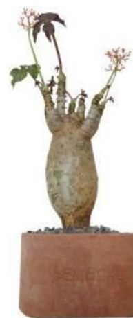
Baobab Buddha 5 years