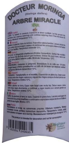
Kit Little Doctor Moringa