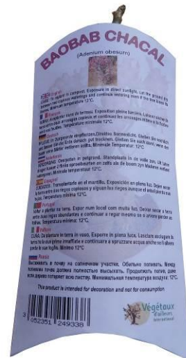
Kit Little Baobab jackal