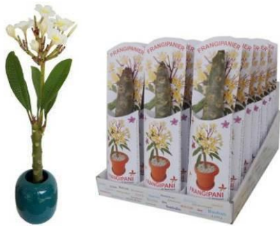
Display box of 30 units

Packaging format 28 x 7 - Frangipani size: 18/24 cm - Average weight: 55g/110g - Instructions for use in 8 languages