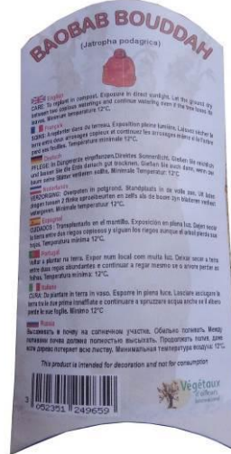
Kit Little Baobab Buddha